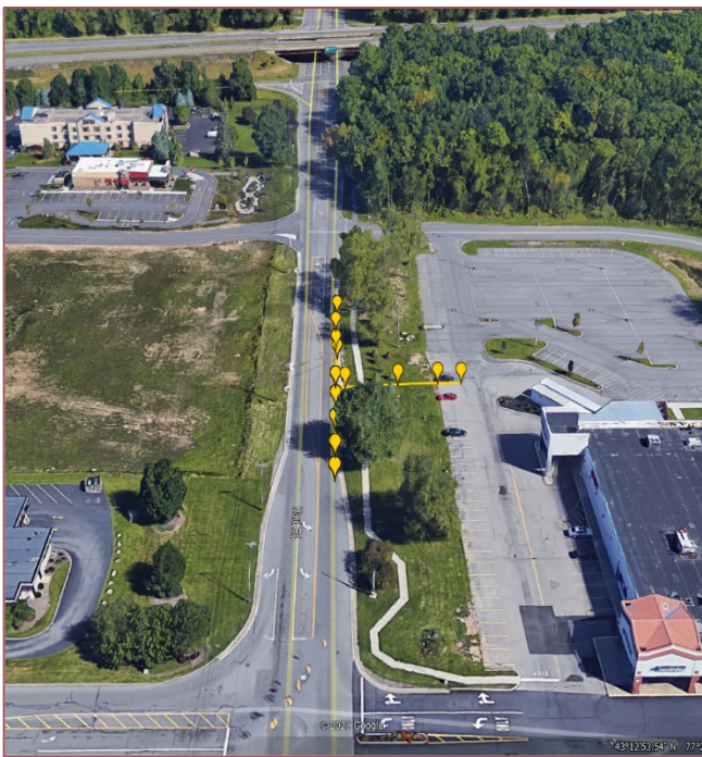
Hard Rd., Webster NY - Gas Main Locations

OTM is the first locating company Avangrid has utilized to create GPS coordinates with depth readings associated with the GPS flagged locations.