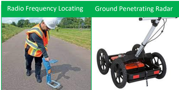
Detecting Equipment & Instruments

To locate & mark private or customer owned and maintained utilities, On The Mark employs non-invasive detection instrumentation, RF & GPR. No digging required. Highly trained and experienced technicians specialize in accurately locating underground utilities.